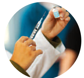
VACCINATION RATES UP CareNavigator has helped some hospitals sharply increase flu vaccination rates.

“We have solid evidence that it reduces readmissions and reduces unnecessary emergency room visits at a significant level,” he says. “When patients are engaged in their care and get very good communication, they can improve their own outcomes.” ■