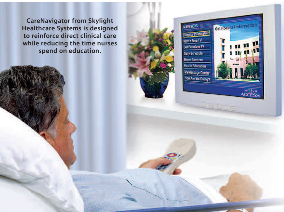
CareNavigator from Skylight Healthcare Systems is designed to reinforce direct clinical care while reducing the time nurses spend on education.