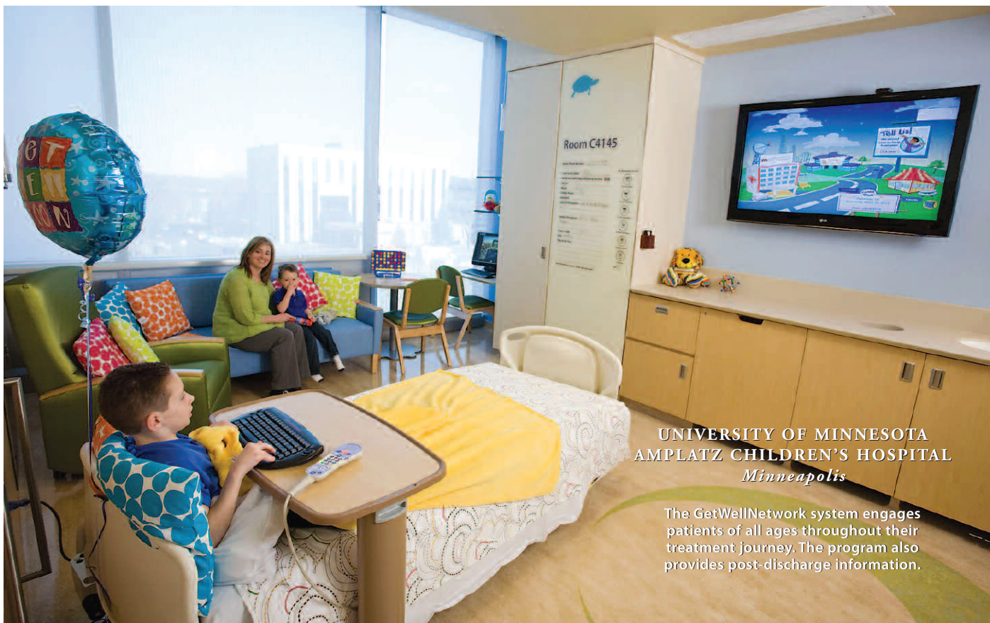
UNIVERSITY OF MINNESOTA AMPLATZ CHILDREN’S HOSPITAL Minneapolis

The GetWellNetwork system engages patients of all ages throughout their treatment journey. The program also provides post-discharge information.