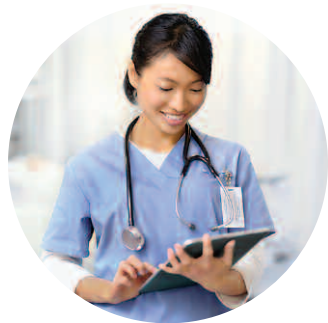
STAFF EFFICIENCY Patient engagement media can help caregivers perform many tasks more efficiently.

W hen Phoenix Children's Hospital opened its new tower, it wanted a way to inform parents and children about resources available on the 40-acre Arizona medical campus.