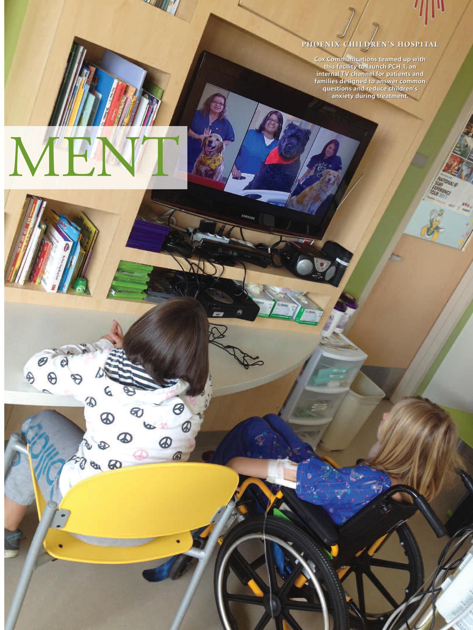
CLOCKWISE FROM BOTTOM LEFT: PHOTO COURTESY OF SKYLIGHT HEALTHCARE SYSTEMS; ISTOCKPHOTO.COM; PHOTO COURTESY OF PHOENIX CHILDREN'S HOSPITAL

Cox Communications teamed up with this facility to launch PCH 1, an internal TV channel for patients and families designed to answer common questions and reduce children's anxiety during treatment.