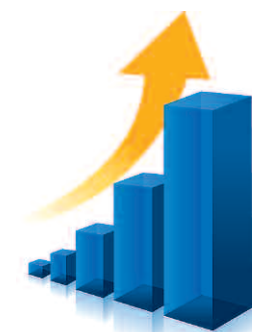
BOOST HCAHPS SCORES Media content can help boost patient satisfaction scores.