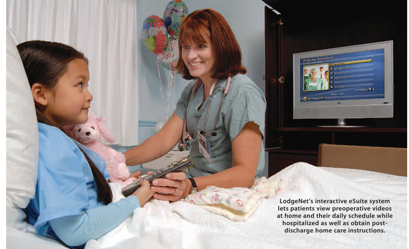
LodgeNet’s interactive eSuite system lets patients view preoperative videos at home and their daily schedule while hospitalized as well as obtain post-discharge home care instructions.

The TIGR and iTigr interactive patient education systems from TeleHealth Services ( www.telehealth.com ), Raleigh, N.C., are accessed via a Web portal developed by Emmi Solutions ( www.emmisolutions.com ), Chicago; patients