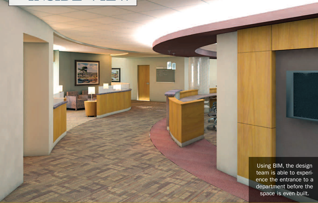
Using BIM, the design team is able to experience the entrance to a department before the space is even built.