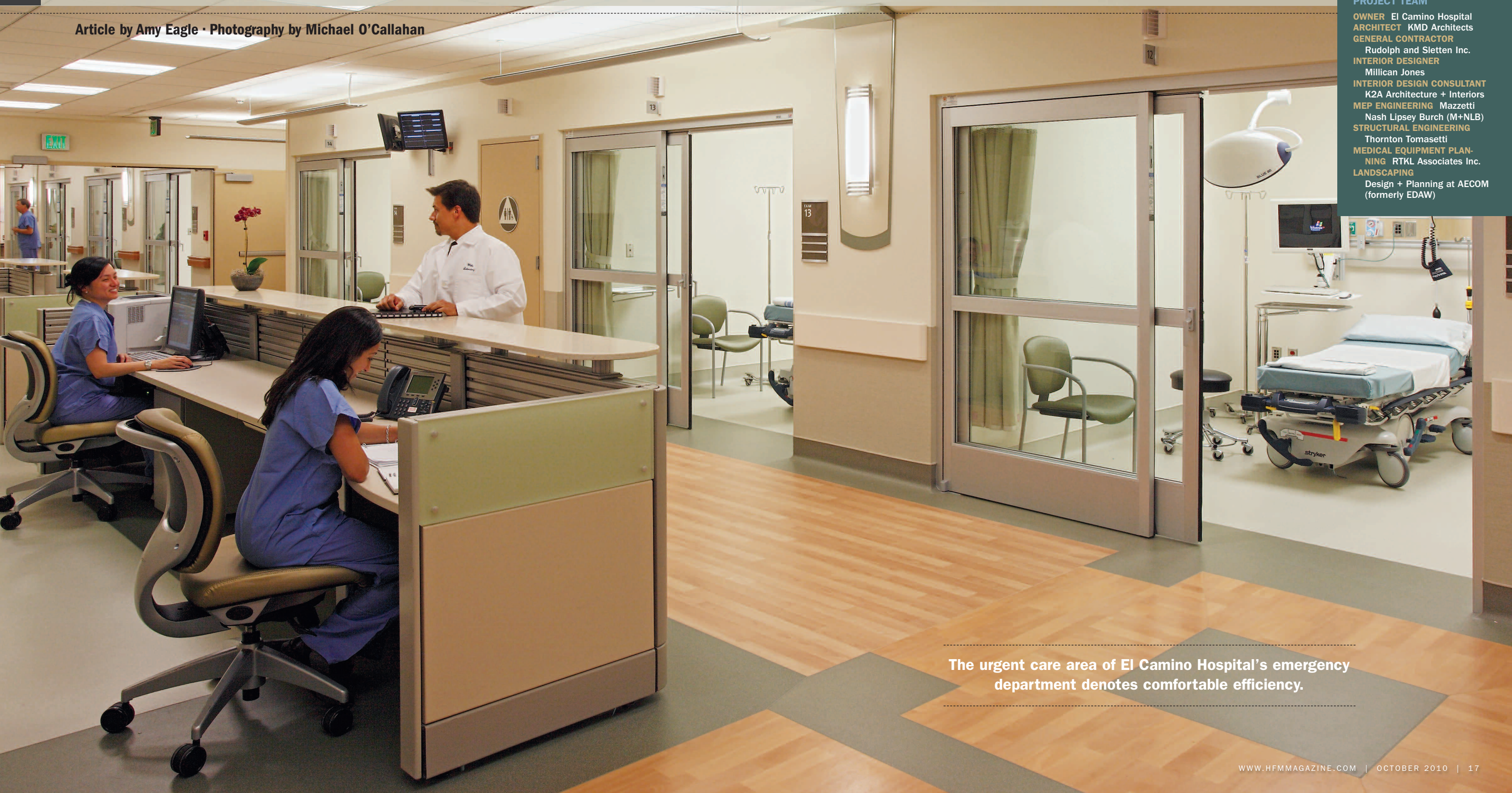
The urgent care area of El Camino Hospital's emergency department denotes comfortable efficiency.

OWNER El Camino Hospital ARCHITECT KMD Architects GENERAL CONTRACTOR Rudolph and Sletten Inc. INTERIOR DESIGNER Millican Jones INTERIOR DESIGN CONSULTANT K2A Architecture + Interiors MEP ENGINEERING Mazzetti Nash Lipsey Burch (M+NLB) STRUCTURAL ENGINEERING Thornton Tomasetti MEDICAL EQUIPMENT PLANNING RTKL Associates Inc. LANDSCAPING Design + Planning at AECOM (formerly EDAA)