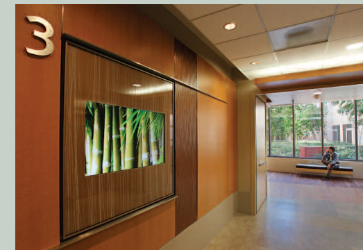
TOP A surgery waiting area on the second floor features "American Diorama," a 45-minute digital art piece.